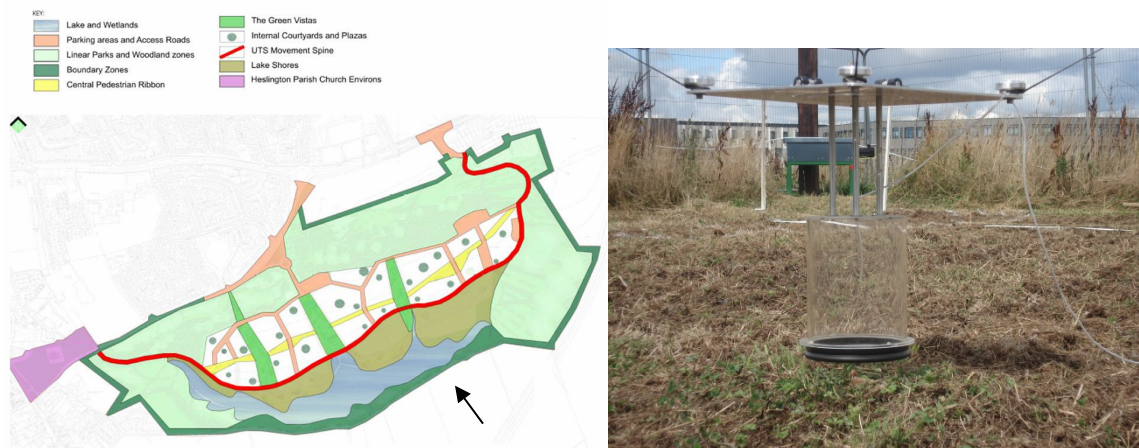
Fig. 2. Showing the location of the SkyGas prototype system on the York campus, with a photograph of the moving chamber head (foreground) and one of the supporting posts and winches in the background.

solely within this defined area where the loaned GEF equipment was deployed.