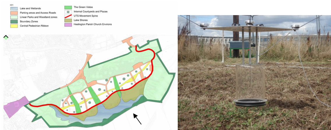
Fig. 2. Showing the location of the SkyGas prototype system on the York campus, with a photograph of the moving chamber head (foreground) and one of the supporting posts and winches in the background.

solely within this defined area where the loaned GEF equipment was deployed.