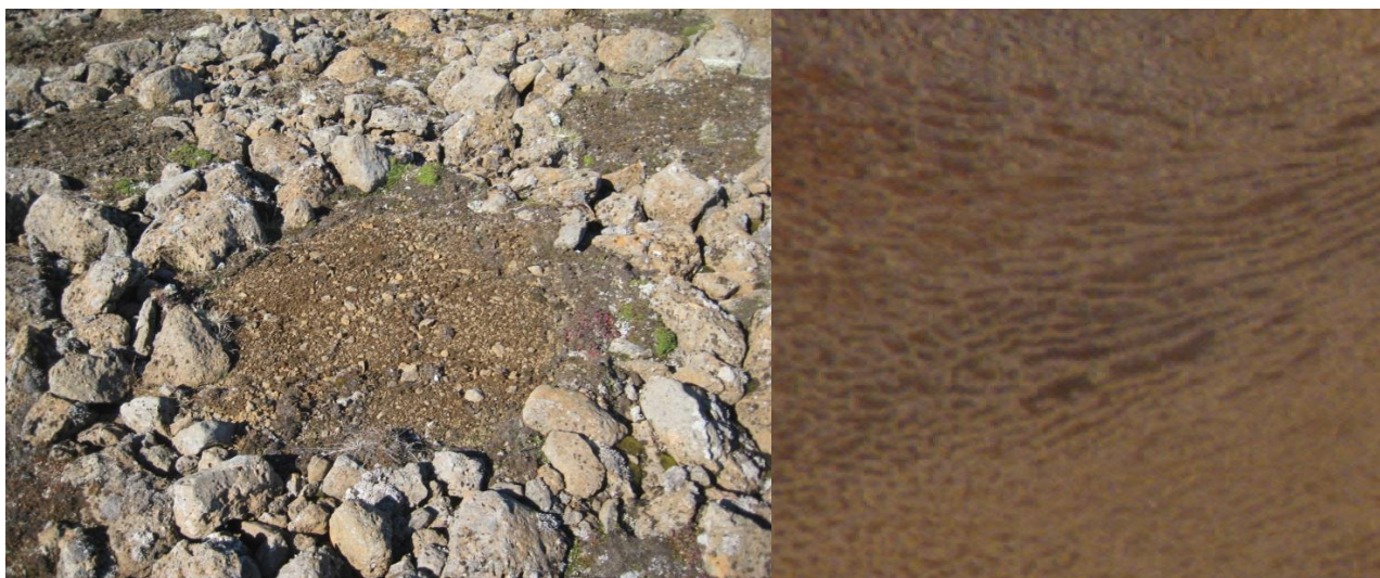
Figure 3: Left: metre scale Sorted patterned ground on top of Tindastóll. This circle is approximately 1.5 m across. Right: NERC ARSF aerial image of the summit of Tindastóll. From right to left, sorted circles can be seen to become elongated then transition into a series of stripes. Circles are 1-3 metres in diameter.

From field observations and by using the aerial photography from the NERC ASF survey A.M. Barrett recorded a range of types and scales of sorted patterned ground in the western Skagafjörður region (Fig. 3), which are similar to those he has observed in his martian datasets. Analysis is ongoing and he plans to integrate the topographic data with the image data in order to assess the topographic control of the forms in Skagafjörður and on Mars.