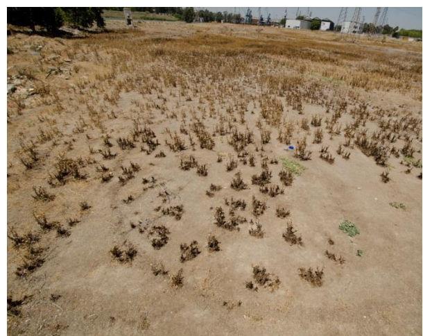
Figure 1. Map of the city of Seville indicating the field site location and an accompanying photograph of the field site itself.

A field study was conducted in the summer of 2012 in wasteland south of Seville, Spain (see figure 1). This site provided various nests of the chosen ant species ( Cataglyphis velox ) in a flat, secure and visually diverse habitat ideal for our study. The primary aim of the tracking section of this work was to record the position and orientation of individually tracked ants as